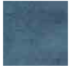
525 Freshwater Blue