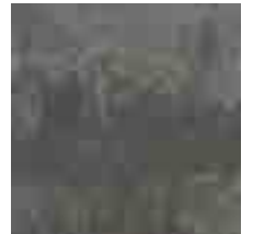
959 So Fetch