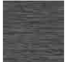
999 Black Ribbon