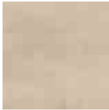
258 Viva Gold