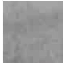
929 Proper Gray