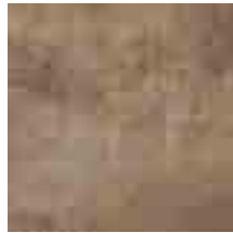
268 My Precious