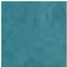
556 Tempo Teal