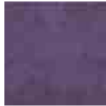
464 Vogue Violet