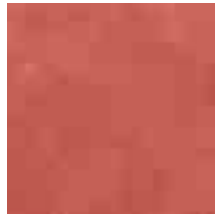
353 Rave Red