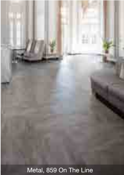
Metal, 859 On The Line

Mass Appeal's luxury vinyl tile, 18"x36" loose lay plank format creates bold installations with innovative modern textures. Drawing inspiration from oxidized metal and natural linen textures, Metal and Matter are beautiful, versatile and eclectic. With pops of metallic, this flooring solution appears multi-dimensional and coordinates beautifully with Mohawk Group's Iconic Earth and other collections, for textural layering and harmonic patterning.